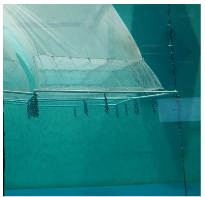
An experimental measurement of wake velocity downstream of a scale model square cage array, using 8 Swoffer current meters mounted to a vertical bar. The vertical bar was traversed across the flume tank to capture a plane of velocity measurements at certain distances downstream of the cages.

"CIMTAN has given me the opportunity to travel across the country and meet some very interesting people doing some very exciting things. Sometimes during my experiments, I found it hard to stay a-wake; hydrodynamics can be such a drag" ( Adam Turner, CIMTAN MASc candidate ).